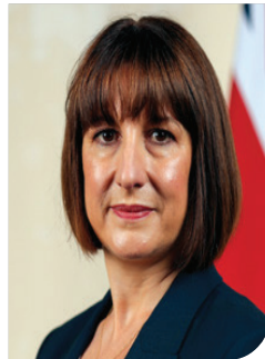
Official portrait of Rachel Reeves MP, by Lauren Hurley, licensed under Open Government Licence v3.0

The OBR, blushing from its pre-emptive publication of documents on the day, at least managed to summarise matters neatly: "...the Budget delivers a frontloaded increase in spending of £9 billion and backloaded increase in taxes of £26 billion".